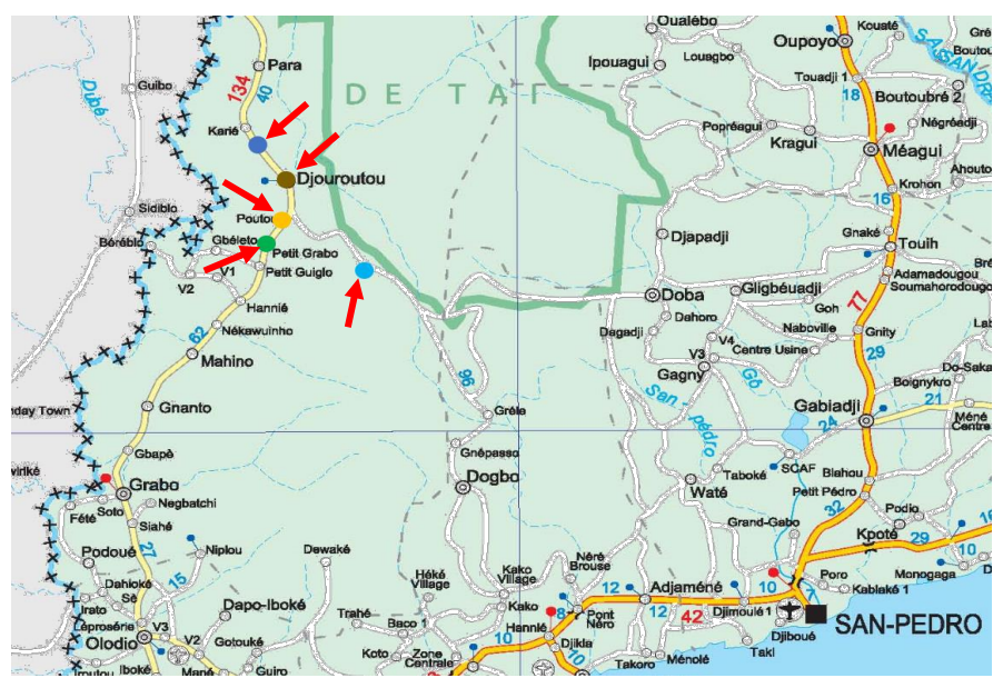
Map 1 : Localisation of the 6 communities (→) of Cooperative Agricole Fraternité de Djouroutou (COOFADJOU) and Société Cooperative Agricole des Producteurs de Petit Grabo et Youkou (SCAEPGY). One of the six communities, Béoué, is north of these sites and not shown in the map above.

This project addresses some of these underlying threats both by supporting the cocoa industry in its efforts to remove deforestation and poaching from its supply chain and by promoting a deforestation-free agricultural economy through the creation of a Landscape Management Board in South-West Taï. To date, project efforts have supported the rehabilitation of degraded areas across six communities in the districts of Béoué, Petit Grabo, Poutou, Djouroutou, Youkou and Daoudi, working with 527 cocoa-growing farmers. Overall, we hope to impact the wider population of these districts, estimated to be over 24,000 people, of which 11,000 are women, mostly living below the $2 per day poverty line<sup>3</sup>. The project communities are shown in Map 1 below, with the proposed biological corridor shown in Map 2 .